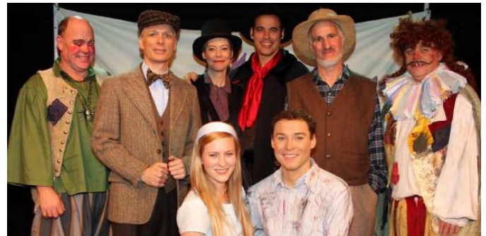
Cast of The Fantasticks

I have worked on many plays in the past, but there are not many about which I can say that I was sad when the run finished - The Fantasticks is in that category. It's not just the content of the play, but the music, the actors, and of course the whole team that brought to life a dialogue and score, turning both of these into something that was amusing, heart warming, poignant, and a pleasure to listen to and watch.